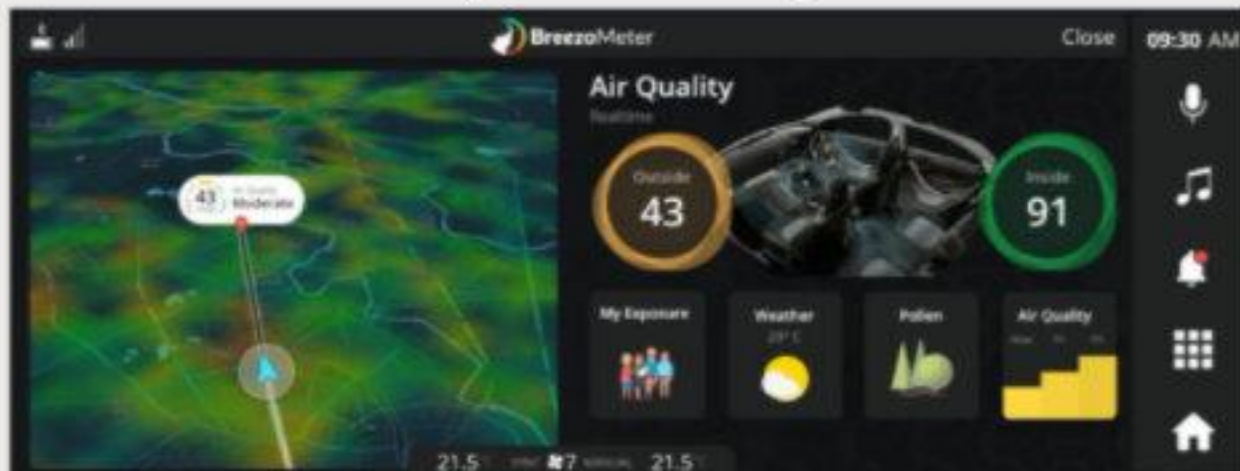
Tata Motors, TMETC and Tata Elxsi have partnered BreezoMeter to provide an in-vehicle service that will allow drivers to see real-time information about the air quality in their vicinity on their car dashboards and empowers them to make informed choices.

We already talked about Autonomai as an investment and how we are using that for customer programs. Additionally, a big investment we have done