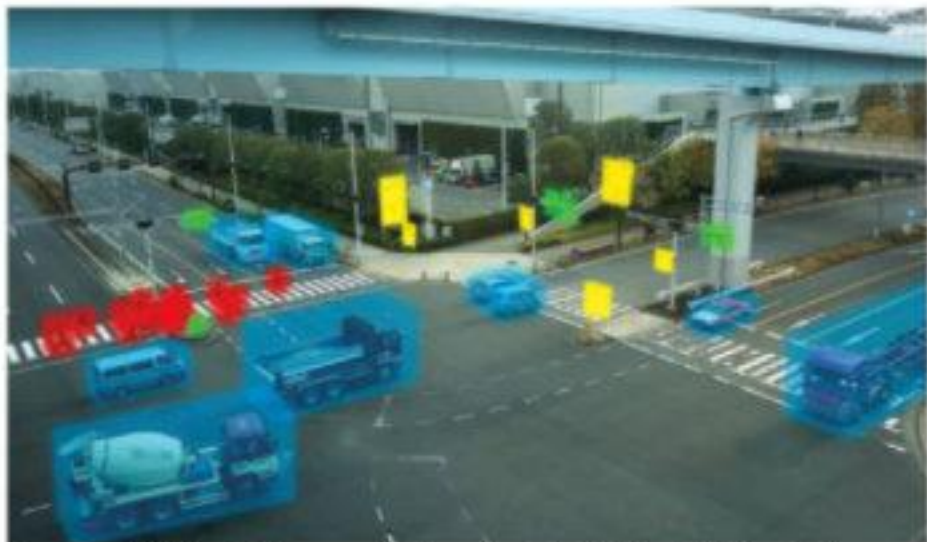
The company's V2X Emulator is a comprehensive and customisable test solution for vehicle-to-infrastructure testing. It has an equipment setup which is capable of generating real-time RF and CAN signals inside a laboratory, and can be closely related to real-world scenarios.

Vehicles that drive themselves and instant teleportation have been long a feature of science fiction. While we are