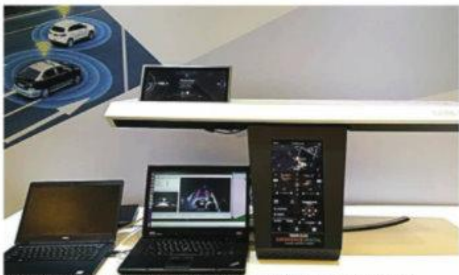
Tata Elxsi's eCockpit solution addresses all the requirements of a full-feature vehicle cockpit, supporting infotainment, instrument cluster, HUD and ADAS functionalities on a single SoC (System-on-a-Chip) while maintaining the highest levels of safety, security and performance.

still decades away from teleportation, self-driving technologies have started making their mark in the automotive space. While it may some time before fully autonomous vehicles become a common feature on roads, some technologies, which help replace some manual functionality to autonomous capabilities, have started entering the global as well as the Indian markets.